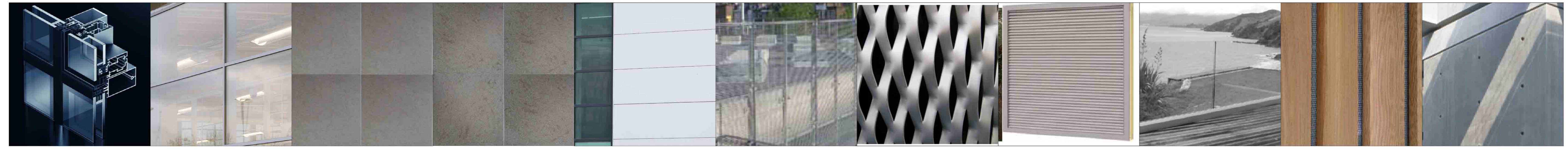
7 SCHUCO FW50 SG GLAZING UNIT POLYESTER POWDER COATED ALUMINIUM CURTAIN WALL WITH DRY GASKET 8 SCHUCO FW50 PLUS W17, 17A, 17B - DOUBLE GLAZED POWDER COATED SCHUCO PRESSURE CAPPED DRAINED AND VENTILATED CURTAIN WALL 9 LIMESTONE RAINSCREEN HONED W29 - Limestone Azul Botteg honed finish 10 LIMESTONE RS BUSH HAMMERED Limestone Azul Botteg honed finish base pflth 300mm to be bush hammered 11 EUROPANEL W4 - Polyester powder coated aluminium composite panel 12 FENCE WALL W25 - Galvanised steel flat bar fence by onorgite 13 FENCE WALL W14 - EYE TECH ANODIZED ALUMINIUM MESH 14 PPC ALUMINIUM LOUVRE Polyester Powder coated louvre 15 GLASS BALUSTRADE W12 - toughened and laminated baluster panel inter layer to be clear, edges polished, brushed stainless steel coping and clamp fixed to balcony or parapet 16 TIMBER FENCE WALL W11 17 omitted