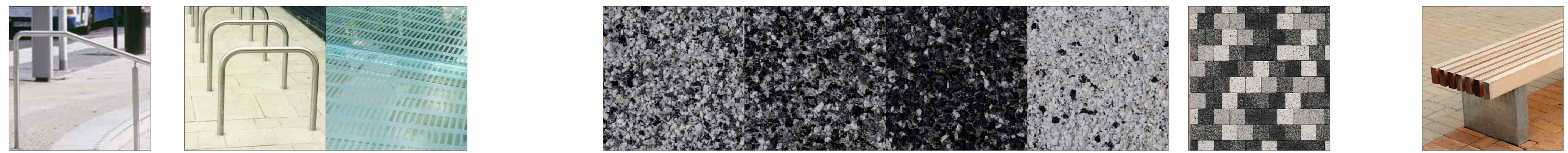
18 HANDRAIL W15 - BRUSHED STAINLESS STEEL 19 BIKE STAND BRUSHED STAINLESS STEEL 20 FRITTED GLASS 21 ZUIDTANGENT PAVER TYPE B 22 ZUIDTANGENT PAVER TYPE C 23 ZUIDTANGENT PAVER TYPE D 24 ZUIDTANGENT PAVER TYPE E 25 ZUIDTANGENT PAVER FB7C/D/F/G/H 26 PRECAST CONCRETE PLANTER FB14 - TYPE C FINISH

NOTE: CGI VIEWS INDICATIVE ONLY, ALL SUBMITTED DWGS TAKE PRECEDENCE